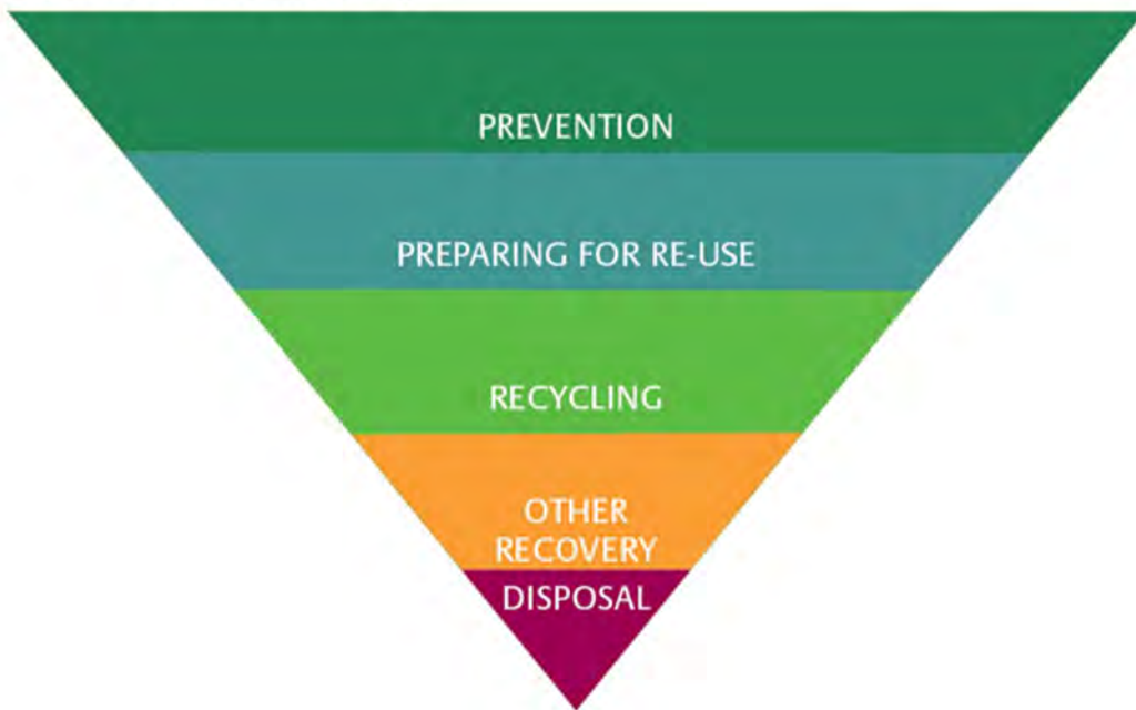
Figure 2: Waste Hierarchy

3.124. Given the pressing urgency of climate change and the need to embed the principles of the circular economy into all areas of our society, we encourage developers to consider including community spaces that help reduce waste and build community cohesion through assets such as community fridges, space for sharing , refill stations, and space for local food growing etc.