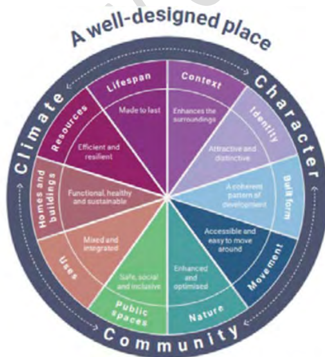
Figure 3: The ten characteristics of well-designed places (National Design Guide)