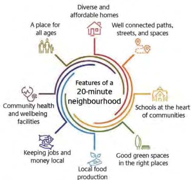
Figure 4: 20 Minute Neighbourhoods

3.318. The 20-minute neighbourhood is about creating attractive, interesting, safe, walkable environments in which people of all ages and levels of fitness are happy to travel actively for short distances from home to the destinations that they visit and the services they need to use day to day, such as for shopping, school, community and healthcare facilities, places of work, green spaces, and more. These places need to be easily accessible on foot, by cycle, by wheelchairs, or by public transport, and accessible to everyone, whatever their budget or physical ability, without having to use a car. This is partly why the strategy set out within this plan focuses development to the most sustainable and accessible places and where there are maximum opportunities for delivering enhancements, especially by using sustainable modes of transport. The 20-minute neighbourhood idea is also about strengthening local economies by keeping jobs and money local and thus facilitating local food production, to help create jobs and the supply affordable and healthy food, more locally for all.