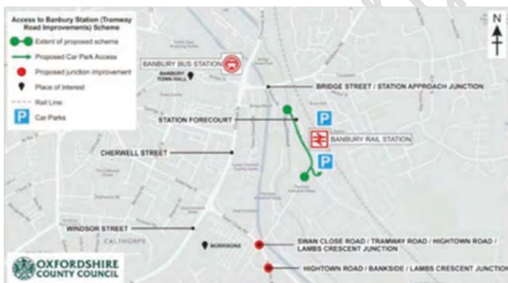
Banbury Tramway Road Improvements